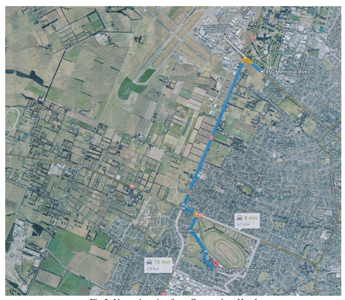
Fig 2: Venue location from Commodore Hotel